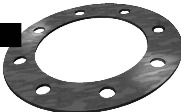
Colour - Black

Thickness range = 0.4mm to 6.0mm Standard sheet sizes = 2.0m x 2.0m, 2.0m x 1.5m, 2.0m x 1.0m, 1.5m x 1.5m, 1.5m x 1.0m. Standard roll sizes = Up to a maximum size of 6.0m x 2.0m Available with a fine mesh mild steel reinforcement: Novus 10 Metallic, it can also be supplied with anti-stick finish. Supplied as standard with anti-stick coating. Can also be supplied with graphite coating.