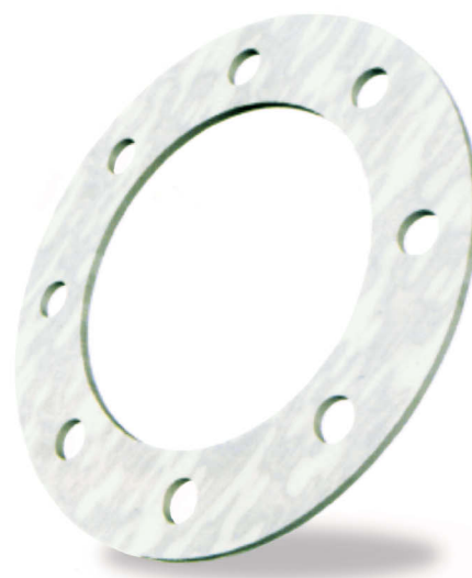
Colour - White

Standard sheet sizes = 1.0m x 1.0m, 1.5m x 1.0m, 2.0m x 1.0m, 1.5m x 1.5m, 2.0m x 1.5m, 2.0m x 2.0m.