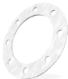
Colour - White